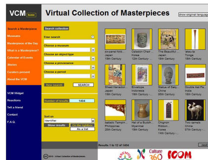
Search a masterpiece page